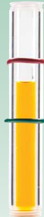
THE ESCO WAY